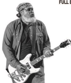
FULL BAND SHOW

GRAMMY AWARD-WINNER ALVIN YOUNGBLOOD HART A true master of authentic blues, Americana, & cosmic rock 'n' roll. Don't miss this living legend live.