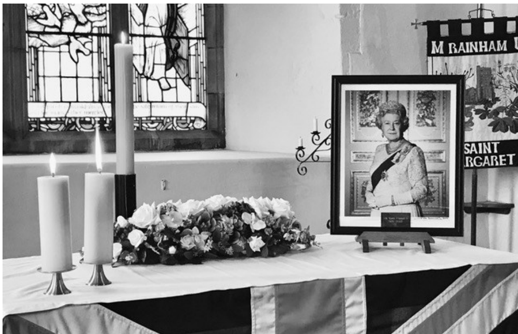
The final, beautiful tribute to Her late Majesty Queen Elizabeth II in the North Chapel (or Lady Chapel) in St Margaret's Church during the official period of mourning.