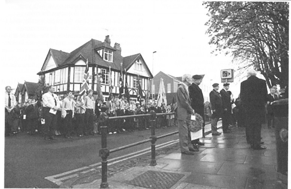
Remembrance Sunday c.2007

St Margaret's Church was packed for Remembrance Day Services at this time. After the service the whole congregation gathered on the A2 (all traffic was stopped) for the two minute silence and the laying of wreaths. This year the major event to commemorate the sacrifices made will be road by road with residents observing the two minute silence on their doorsteps at 11am on Sunday 8th November. See article about the memorial and the Rainham men listed on it on page 3.