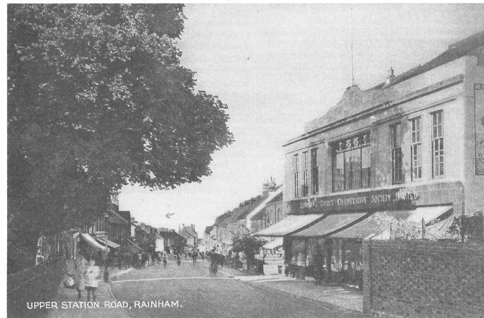
UPPER STATION ROAD, RAINHAM.

Rainham Co-op at the top of Station Road opposite the old Church School was established in 1896 and served Rainham for over 100 years before finally closing. The building went through several refits but although this picture was taken in the 1930s it was probably still like this when Denise Hazelden began working in the haberdashery department (see Memories of Rainham on page 9). Prior to the building of Rainham Shopping Centre the Co-op was by far the largest store in Rainham and supplied most of our needs from several different locations encouraged initially by the share scheme when we quoted our members number with each purchase and later the 'blue stamps' scheme. An expensive purchase meant much licking of the many stamps received to stick them in books but they yielded good returns in 'free' gifts of your choice.