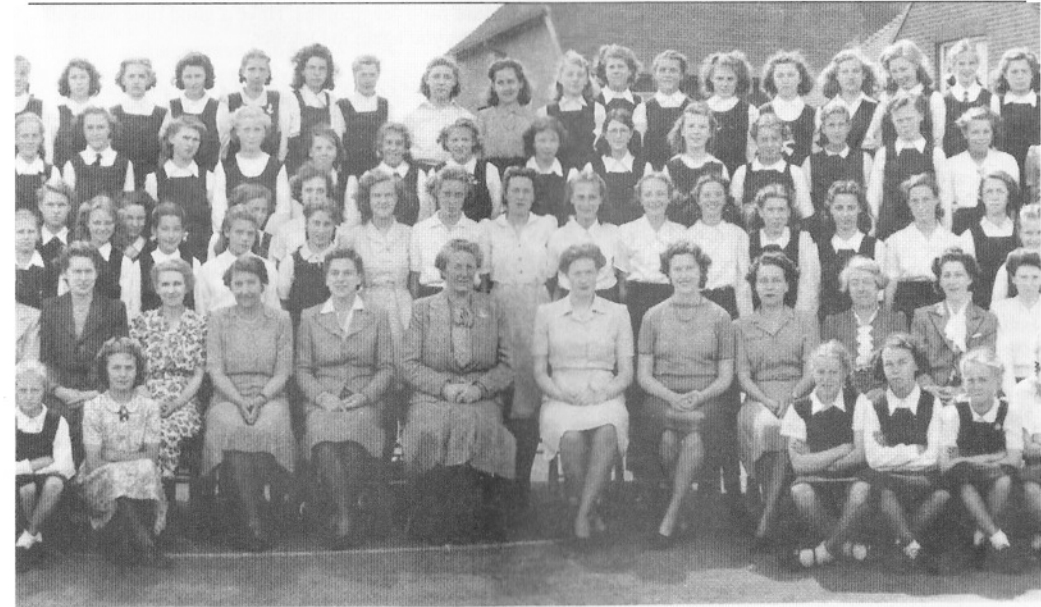
RAINHAM COUNTY MODERN