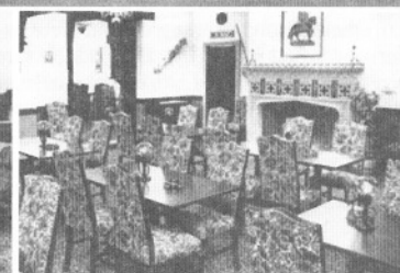
The Queens Head, Wigmore. Main picture soon after it opened in the 1930s showing the front view with car park for more than 100 cars. Small pictures (from the left) the original Lounge Bar with a small curved bar and panelled walls, the rear view Rose Garden with folding metal chairs, and the Lounge Bar after the 1978 refit. See page 9.