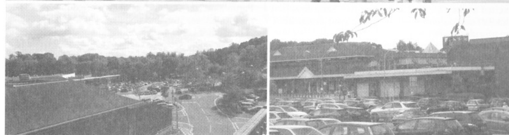
Hempstead Valley Shopping Centre celebrates 40 years—see page 9