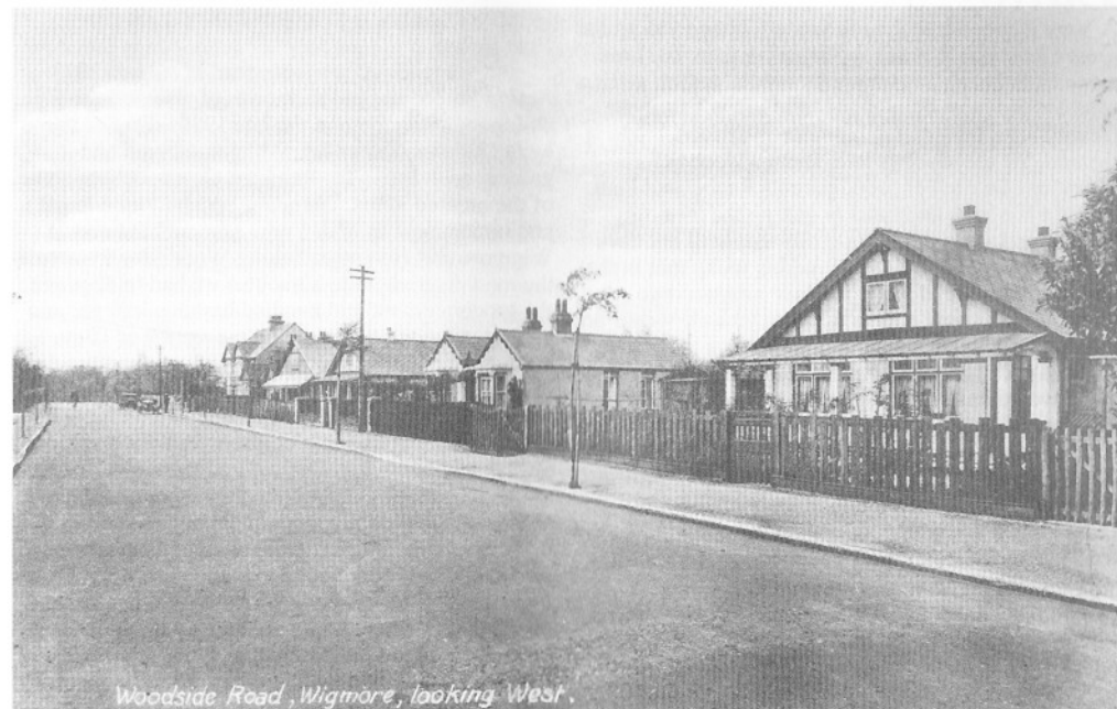
Woodside Road, Wigmore, looking West.

AN INDEPENDENT MONTHLY FOR RAINHAM AND THE SURROUNDING AREA ■