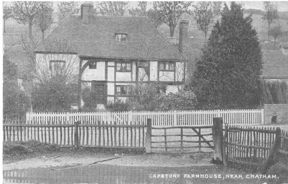
CAPSTONE FARMHOUSE, NEAR CHATHAM.

Capstone Farmhouse is one of the oldest houses in the Medway area. It is situated just opposite the main entrance to Capstone Country Park, and apart from some alterations to the windows the front view has probably changed little in appearance since the house was first built. But the young trees seen behind have now grown to hide the fields beyond.