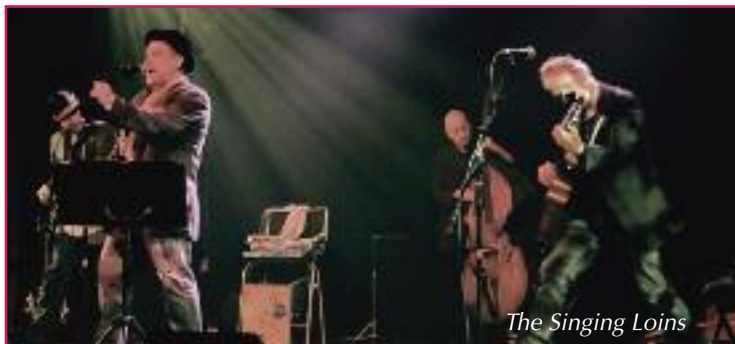
The Singing Loins