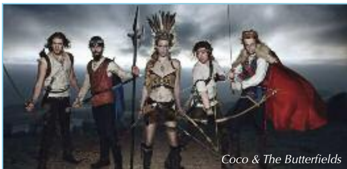
Coco & The Butterfields

Guided walking tour of Rochester led by the City of Rochester Society. The tour will last for approximately 90minutes. Free of charge although donations to the society welcome.